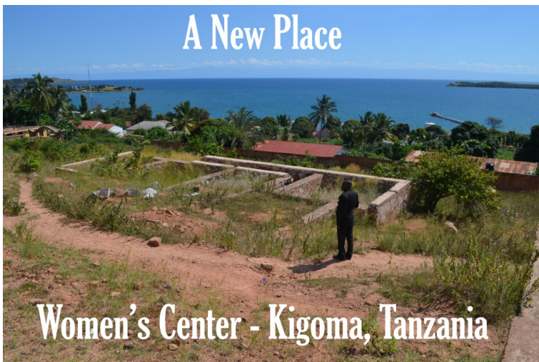
Women's Center - Kigoma, Tanzania

St. Mark's has had a wonderful history with our Christmas Eve offerings. Each year money collected during Christmas Eve Services goes somewhere in the world to make a real difference in the world for the kingdom. This year we will be assisting to build a Women's Center in Kigoma, Tanzania. The Center will be next to the St. Mark's Methodist Church we helped to build there and will be heavily involved in the community to provide opportunities for events, teaching, shelter and other community