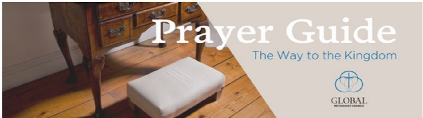
Photo: John Wesley's prayer kneeler – The birthplace of Methodism.

Each morning at 4 a.m., John Wesley would kneel in prayer in his London home. It was in this place that the fires of Methodism began. As we seek to reconnect to our Wesleyan heritage, it seems the best place we can begin is in prayer. Join us in our monthly prayer series: The Way to the Kingdom.